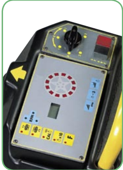
» Control panel integrated with digital viewer and keypad